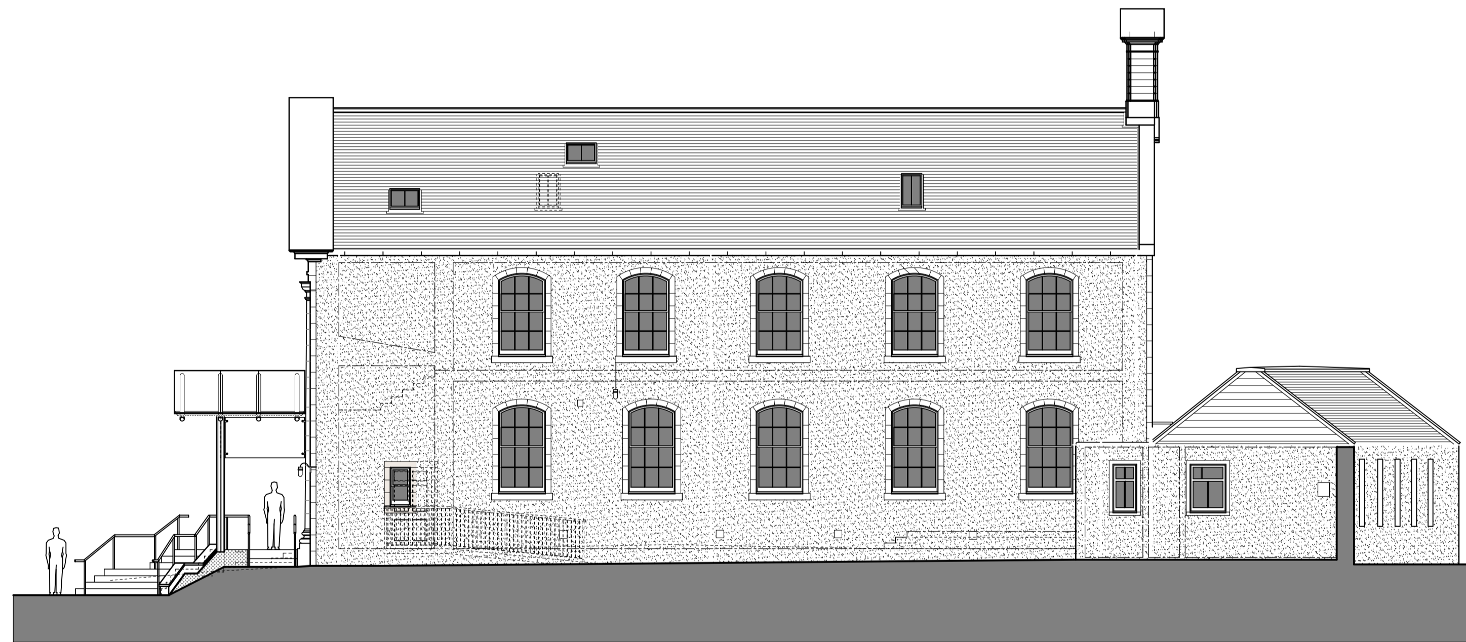
Proposed East Elevation Scale 1:100