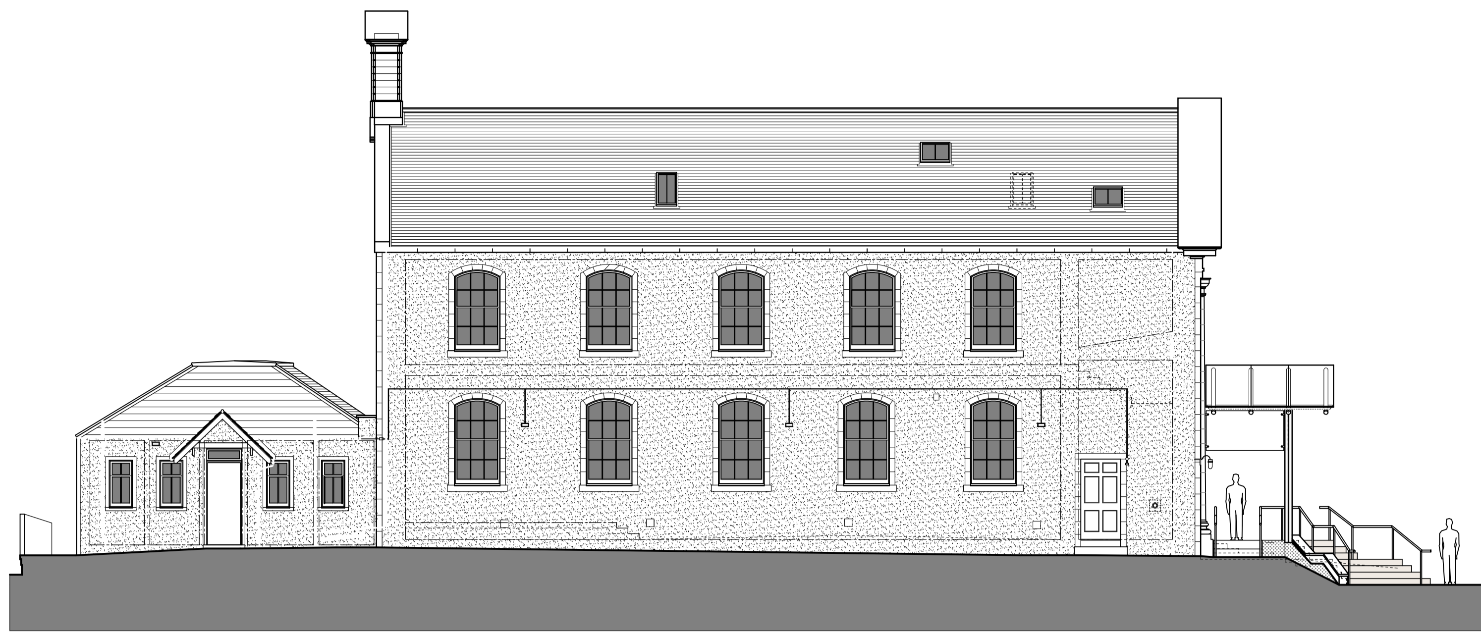
Proposed West Elevation Scale 1:100