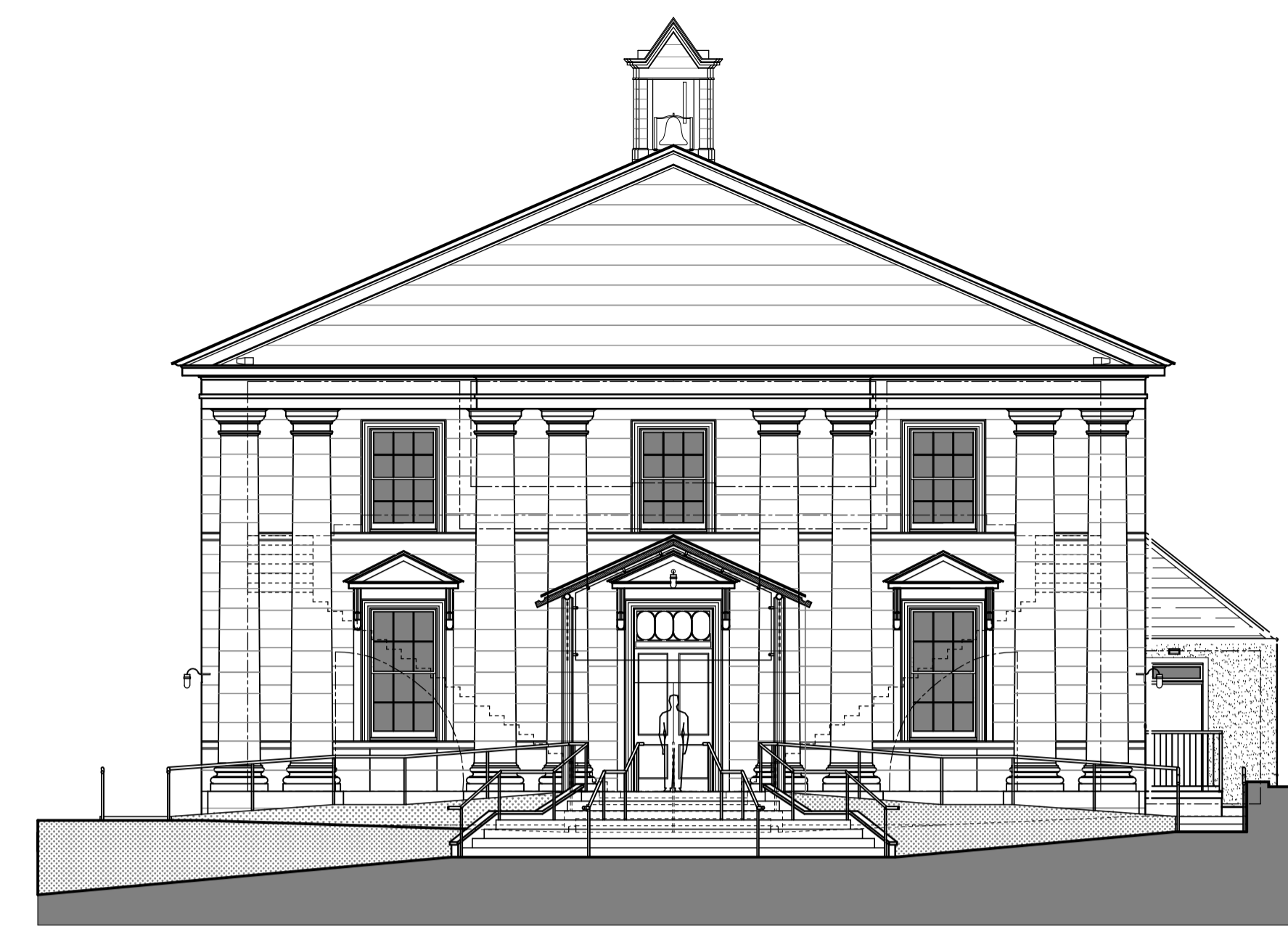
Proposed South Elevation Scale 1:100