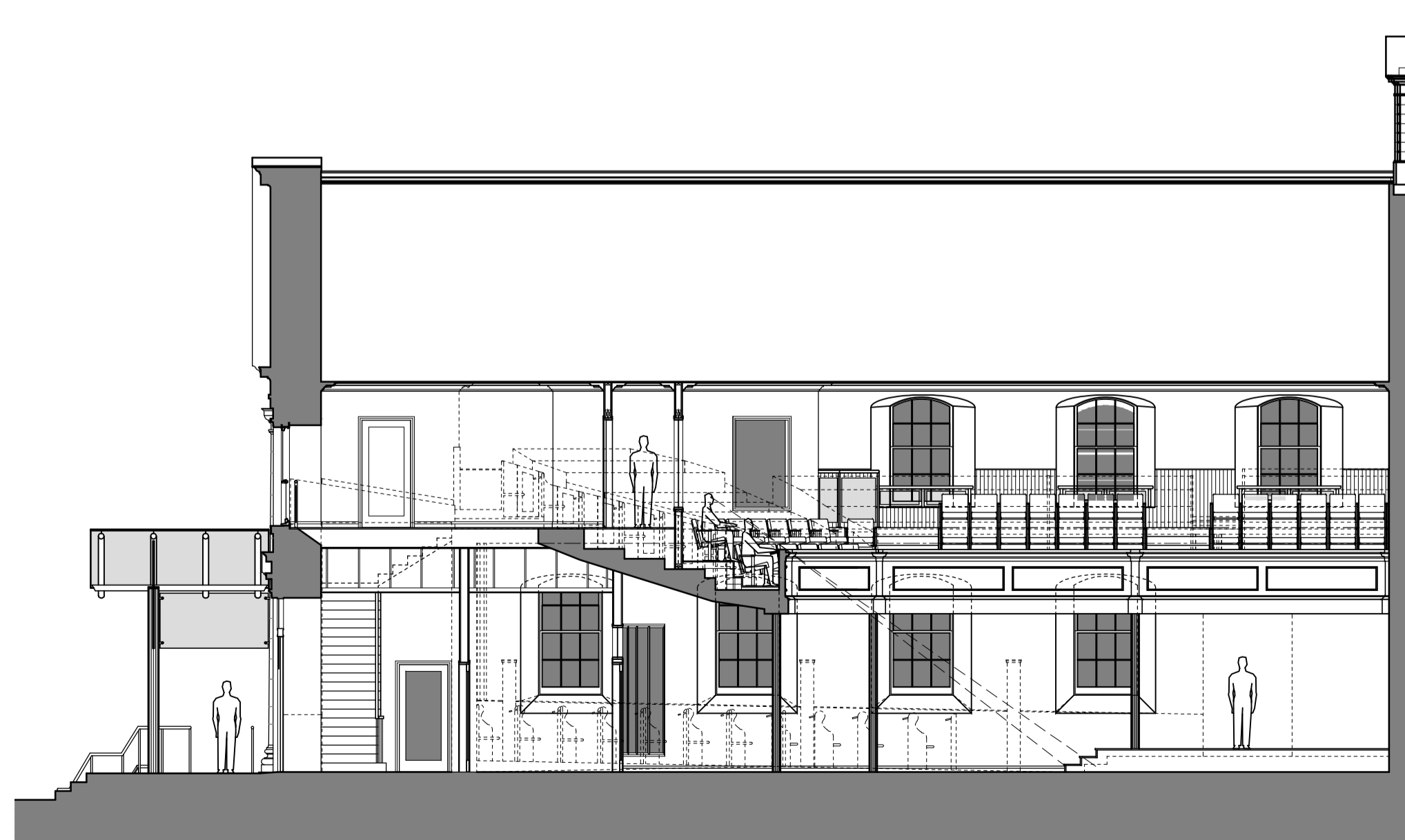
Proposed Longitudinal Section Scale 1:100

This drawing is copyright. All sizes to be site verified. No dimension to be scaled.